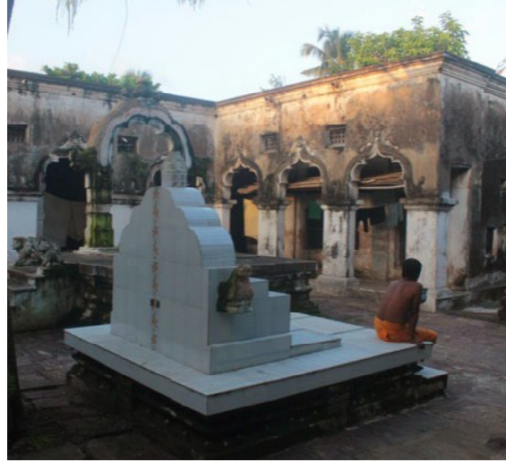
Figure 5: The Bada Odia Matha of Puri awaits due respect.

Gurudwara Bauli Matha Sahib: The Bauli Matha is a gurudwara and monastery of its kind. According to an old resident of the matha , when Guru Nanak visited Puri on a pilgrimage, he constructed a deep well, also known as ‘ bauli ’ at this site. It is said that the concept of bauli did not exist in the coastal town of Puri before this time. The well has been constructed in a way that it has two different passages for drawing water based on the Hindu system of avoidance relationship between the elder brother-in-law and his sister-in-law. The well is dedicated to Lakshmi- the wife of Lord Jagannath, and His elder brother Balabhadra. The bauli has a general large opening on the upper part for Lord Balabhadra and a narrower passage for Goddess Lakshmi for drawing water from the well (Figure 6). There is a room housing the idols of the Hindu Gods, a decorated pedestal holding Guru Grantha Sahib, and a narrow shrine having centuries-old conch shells. This place is maintained by the Udaseen sect of ascetic Sikhs and the Hindus. A Hindu priest looks after the temple and