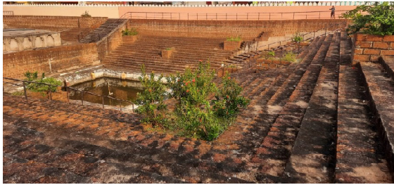
Figure 3: The view of the pond outside Bimala Devi temple Shankaracharya Matha, Puri

travelled far and wide across the length and breadth of India to wake people up from a deep slumber and spread the Vedic teachings to have righteous religious rule over the country. During those times, travelling was difficult and the modes of communication were limited. So, he established four institutions or peethas in the four directions of India to protect and propagate the Hindu Sanatan Dharma . Govardhan Peetha at Puri was established in the 8th Century to deal with the knowledge of the Rig Veda . The presiding deities of this Vedic Peetha (school or seat) are Purushottam and Goddess Bimala. There's an old idol of Ardhanareshwara (Half male-Half female figure) which is believed to have been installed by Adi Shankaracharya himself. The Govardhan Peetha is the oldest monastery in Puri, located in the vicinity of the Swargadwar area of the city. The present Head is the 145th Shankaracharya of Puri Swami Nischalananda Saraswati who is one of the most important person of Puri.