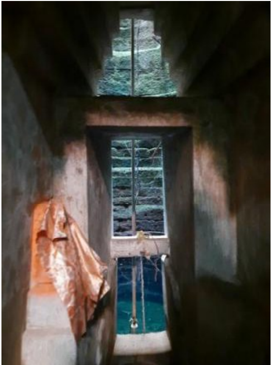
Figure 6: The Bauli or the well

rituals associated with the worshipping of the idols while the Sikh priest looks after the daily worshipping of the highly revered Guru Granth Sahib. Thus, this place has a lot of significance in preaching harmony to the world. However, like the previously mentioned monasteries, the Bauli Matha also awaits due attention and recognition by the people. This matha , despite being located in the prime centre of the infamous Swargadwar, is not a frequently visited place. It has now been encroached upon by various other accommodation facilities, thereby failing to attract visitors to this exquisite site of India's strong socio-religious philosophy. The conditions of the entrance to this site itself speaks of massive ignorance on the parts of all the stakeholders involved (Figure 7).