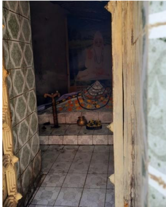
Figure 4: The Kubari inside the shrine in Kabir Chaura Matha, Puri

as both of them regarded him as their saint and desired to conduct the funeral according to their specific customs. The corpse then miraculously turned into roses and was equally divided among the two sections for the final rites. The Kabir Matha, located near the Swargadwar beach, stands as a testimony of the merit of Saint Kabir. As per the legend, in the 1300s, when the Jagannath temple was being built in Puri, owing to the vicinity to the beach, the sea waves would destroy the site frequently. Saint Kabir was on the pilgrimage to Puri at that time. The people of Puri suggested the king request the saint to help them get through this situation. When the king approached Saint Kabirdas for help, the latter buried his kubari (a supporting stick used by the saints) at the site (Figure 4). The narratives tell that the sea never crossed the site of the kubari ever since and the temple and other complexes stand tall even today.