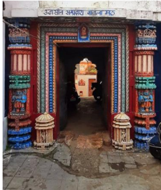
Figure 7: The entrance of the Bauli Matha, Puri